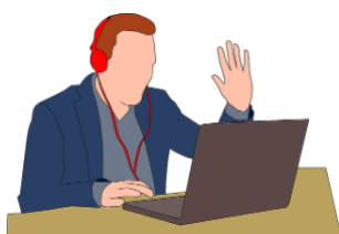
Conference call meetings