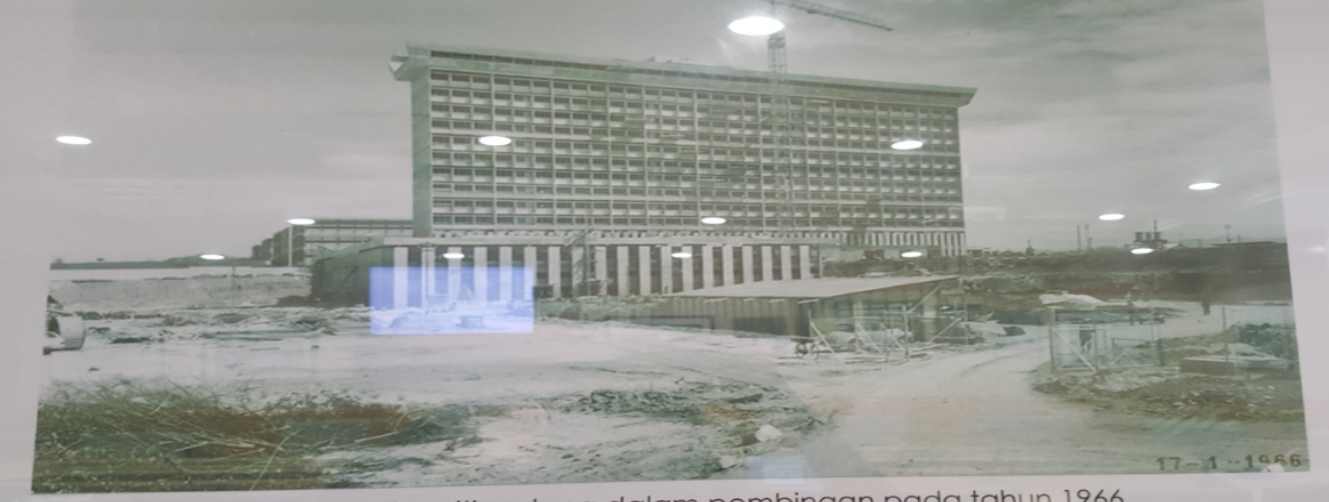
Hospital Universiti sedang dalam pembinaan pada tahun 1966. The University Hospital under construction in 1966.

Leading healthcare terminology, worldwide