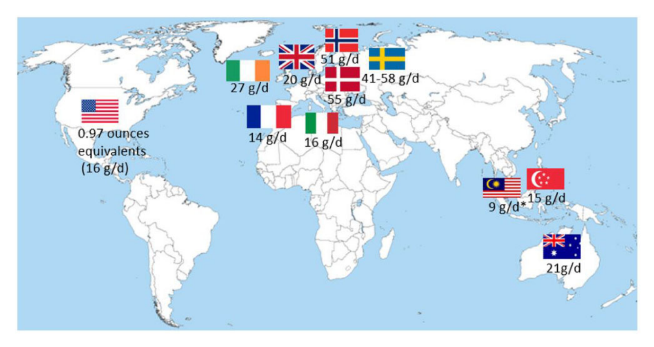
Figure 1 Examples of reported mean intakes of whole grains by adults, highlighting differences among countries that often reflect whether or not traditional foods consumed by the population emphasize whole grains (eg, Scandinavia) or refined grains (eg, Italy, France).