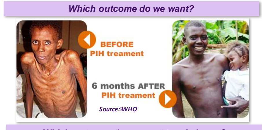
Which outcome do we want to reimburse?